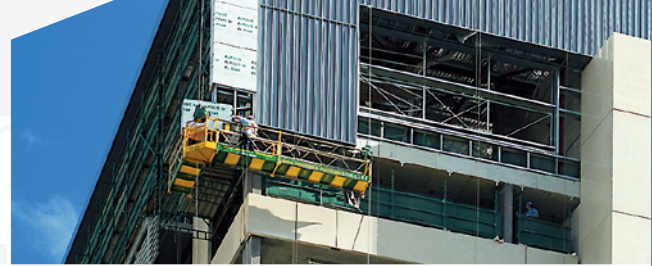
SWING STAGES AND SCAFFOLDING