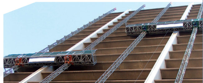
CUSTOM BUILT SOLUTIONS