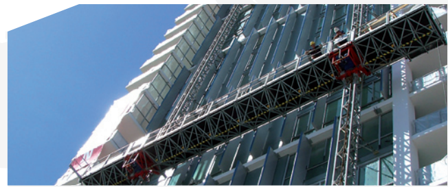
MAST CLIMBING WORK PLATFORMS

Each project normally requires combinations of access equipment and we can provide the complete package for your project.