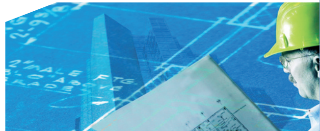
TOTAL CUSTOMER SUPPORT SERVICES